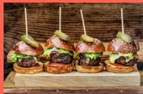
"THE UOB BURGER"

British Beef burger or Mexican spiced bean pattie, brioche roll with cheese, pickles & Lettuce